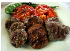
Grilled Meat Balls

The restaurant, located in the center of Meric, has been serving for many years and also offers its customers the use of alcohol in the evening. The traditional dish, the spring fish and the kid, is consumed with raki in long-serving dishes. On business days and nights, the company that provides services on demand has made a name for itself with its quality and taste.