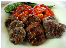
Grilled Meat Balls

The restaurant of Enište which serves for many years in the sub-district of Meriç District is mentioned especially with its publication fish and grilled meatball. The restaurant offers alcohol for men who want to taste different and local tastes. With its menu and quality, it welcomes its guests from Trakya region.