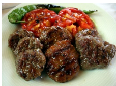
Grilled meat balls

Meriç Dönercisi serves the customers who want delicious döner meal in the city center. In addition to the doner varieties, he has also mentioned his name in the town of Meriç with chicken eggs, chicken saute and sirloin meatballs. In particular, the restaurant that the working group has chosen for lunch has also increased its customer base by providing service to its business establishments.