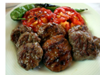
Grilled Meat Balls