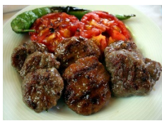
Grilled meat balls

Located in the center of Meriç, Esen Kır Lokantasi is a particularly preferred restaurant in summer months. The Broad Bean and the freshly prepared spring on corn flour are the most preferred dishes in the restaurant. The restaurant, which has alcohol in it, is in great demand in order to allow the raki culture, which is common in the region, to take place in the sofras.