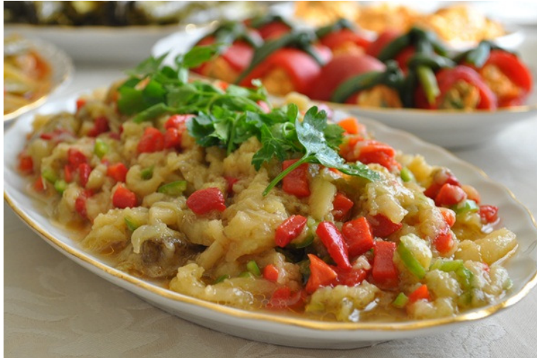
Tolkça (Aubergine Salad)